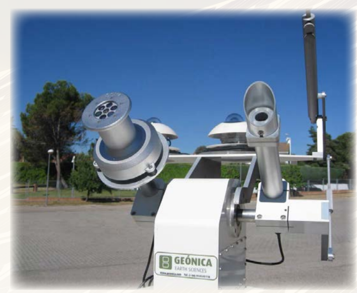
Pyrheliometer, Pyranometer and Solar Spectral Irradiance Sensor mounted on Suntracker-3000

The marriage of the Datalogger METEODATA and the SunTracker-2000/3000 working together, is a unique and exclusive symbiosis solution, which allows to profit all the functionalities of the Automatic Diagnosis and Alarm Software (ADAS-3000) in real-time.